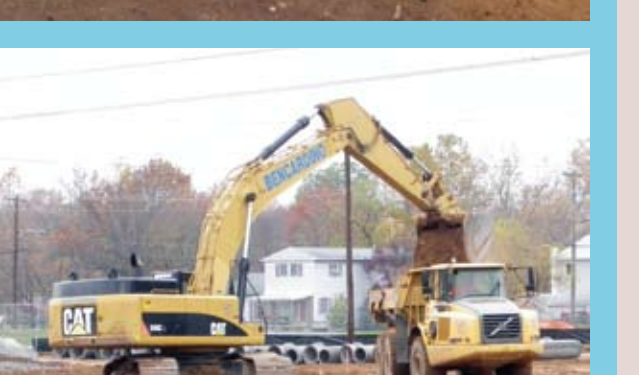
Lower Bucks Safety Training Center