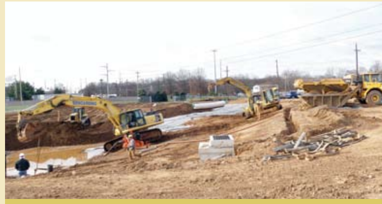
Lower Bucks Safety Training Center