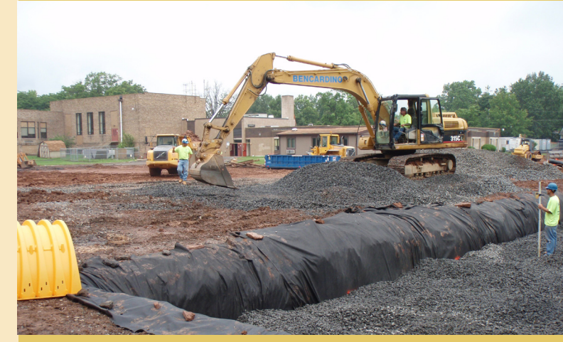
N. Wales Elementary School