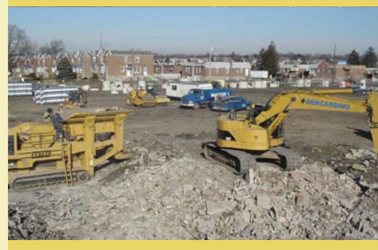
Bustleton & Bligh