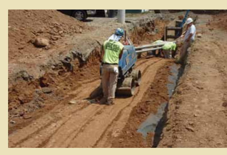
Philadelphia University Excavation